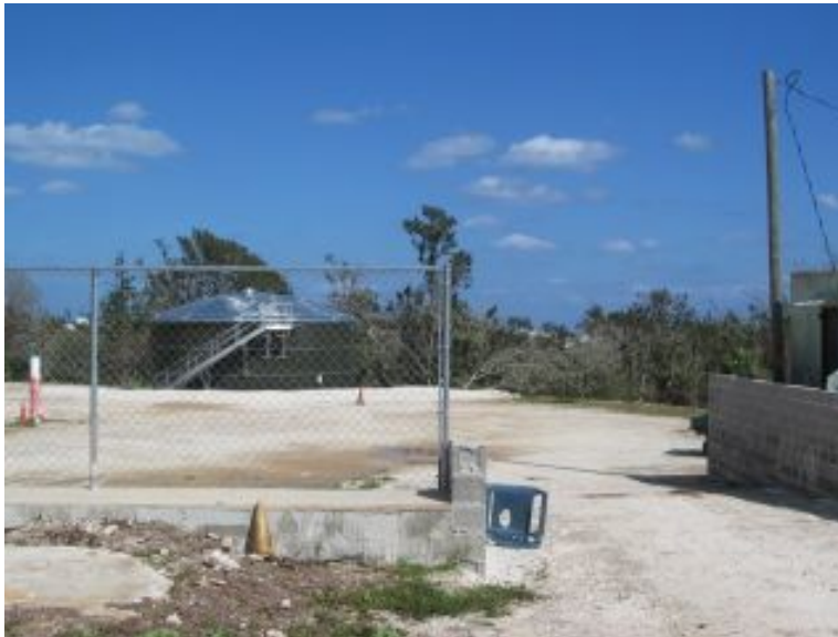
Botanical Gardens site, all shielding removed