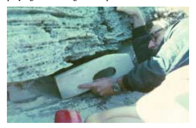
construction of artificial burrows has enabled it to increase from 18 pairs in 1961 (when the entire breeding population first began to be monitored), to 65 pairs in 2003 (Wingate 1985 and unpublished data).

coastal habitat. Lacking soil for burrowing, the Cahow was forced to occupy erosional crevices in the coastal cliffs where it came into nest-site competition with the much more common Whitetailed Tropicbird (Wingate 1978). Despite these limitations, an intensive conservation effort employing defences against tropicbirds and the