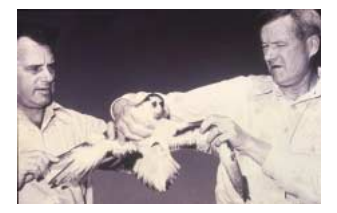
time of its rediscovery in 1951 (Murphy & Mowbray 1951), it survived only on a few tiny predator-free off-shore islets totalling less than one hectare in area and comprised exclusively of rocky