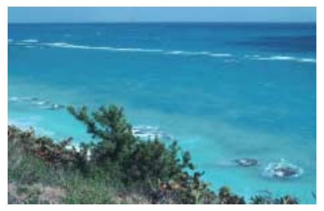
Consequently they are extremely vulnerable to over-wash and wave erosion in major storms and