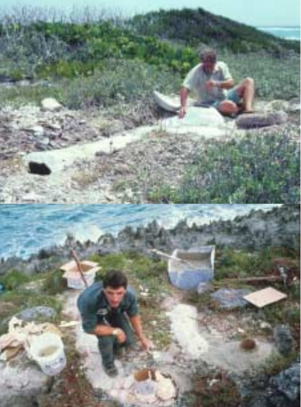
open ocean by Bermuda's unique algal-vermetid "boiler" reefs (Ginsberg & Schroeder 1973).